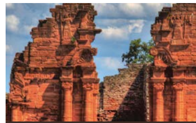
St. Ignacio Mission Ruins

ONLINE BOOKING AVAILABLE | allanpetker.choirtravelinfo.com